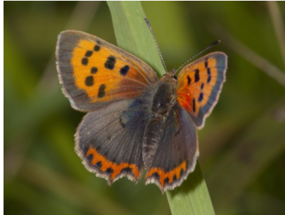
Small Copper

Beginning in the lower field below the reserve proper, we saw a Brown Argus, Common Blue, Small Heath, Brimstone, Orange Tip and Green Veined Whites. We walked along the boundary path through the light scrub, past the small area of impoverished chalk down loved by summer-season Chalkhill Blues to the far west corner of the reserve where we were rewarded with sightings of Holly Blue, Dingy Skipper, Green Hairstreak, Grizzled Skipper and Small Copper all nectaring on the abundance of yellow & blue flowers in this sheltered sunny spot. We also spotted a common lizard in the short sward which was a pleasurable rare reptile sighting.