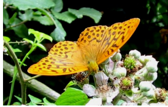
Silver-washed Fritillary

After everyone had a good look at the Silver-washed Fritillary, still excited, we moved on. We all then had an interesting impromptu debate about a “Gatekeeper” that turned out to be a small and oddly marked Meadow Brown - after quite a long period of deliberation.